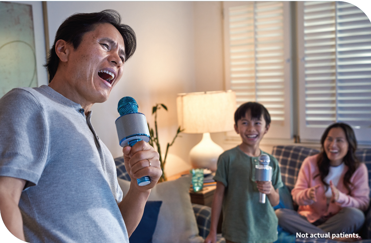
Not actual patients.